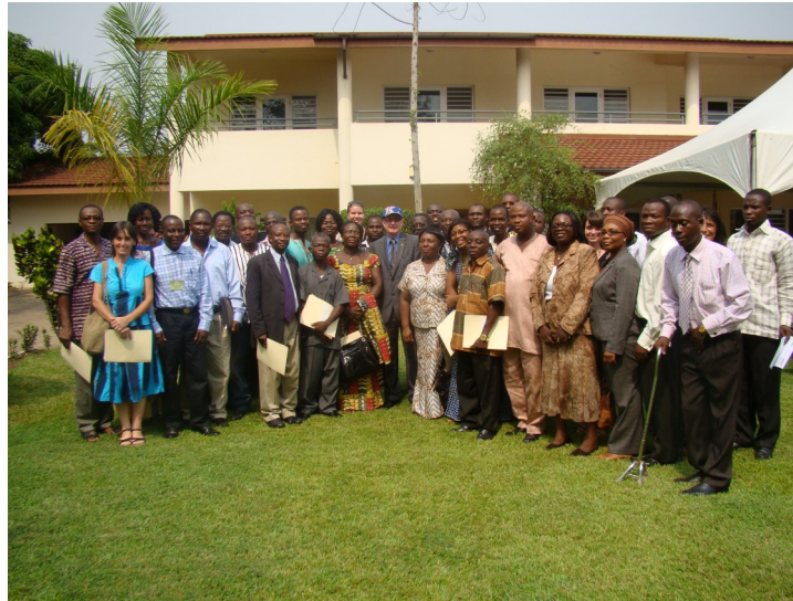
RECIPIENTS OF AUSTRALIAN DEVELOPMENT GRANTS IN A GROUP PICTURE WITH THE HIGH COMMISSIONER AND HIS STAFF

ALL ENQUIRIES SHOULD BE DIRECTED TO THE DIRECT AID MANAGER AUSTRALIAN HIGH COMMISSION 2, SECOND RANGOON CLOSE CANTONMENTS, ACCRA – GHANA PMB 60, KIA – ACCRA TEL: +233 302 216 400 FAX: +233 302 216 410 EMAIL: AccraHC.Enquiries@dfat.gov.au