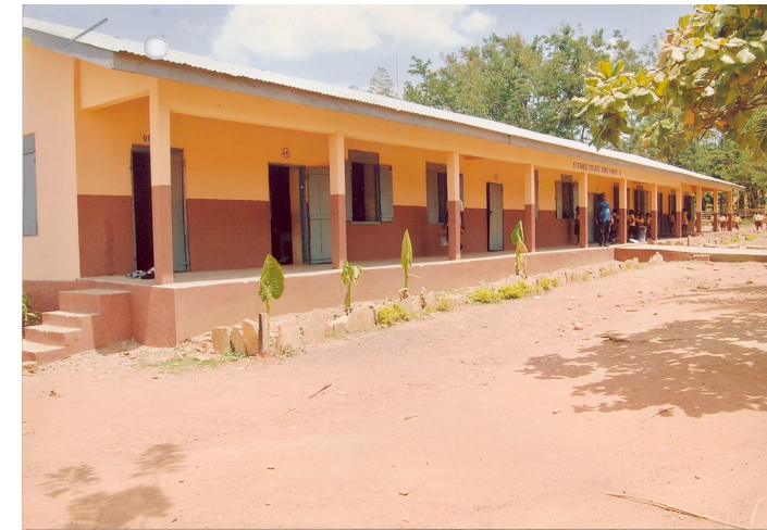
The 90-year old St Francis College Demonstration Primary School Block at Hohoe in the Volta Region renovated with DAP Funds