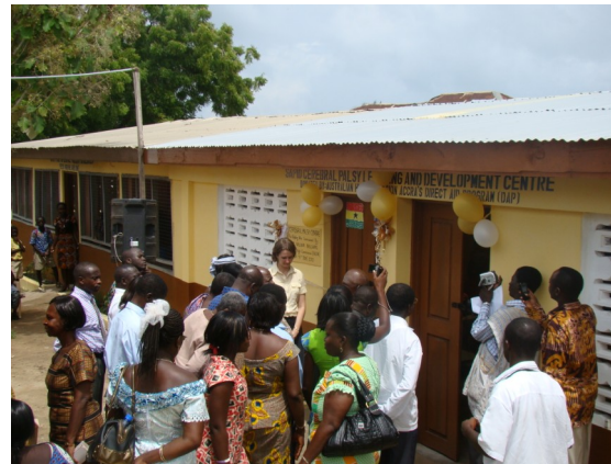
A SCHOOL BLOCK FOR CHILDREN WITH CEREBRAL PALSY IN THE CAPE COAST MUNICIPALITY, BUILT WITH FUNDS PROVIDED UNDER DAP

on development activities on a not-for-profit basis. Projects that support women, children, the disabled, and small and deprived communities are of particular interest.