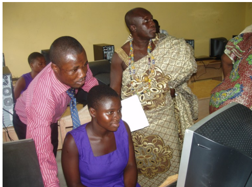
DAP PROVIDED THE AXIM GIRLS SENIOR HIGH SCHOOL WITH AN ICT LABORATORY.

DAP funding is available to non-government organisations and groups working