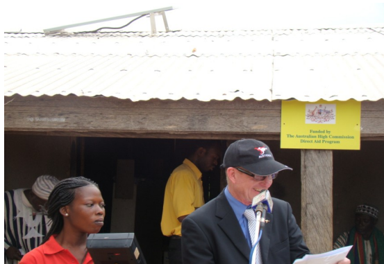
HIGH COMMISSIONER BILLY WILLIAMS LAUNCHING SOLAR LIGHTING SYSTEMS PROVIDED FOR THE SUMBRUMGU WOMEN'S COOPERATIVES IN THE UPPER EAST REGION OF GHANA